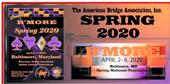
Mark your calendar for the next National Tournament in Baltimore, Maryland.