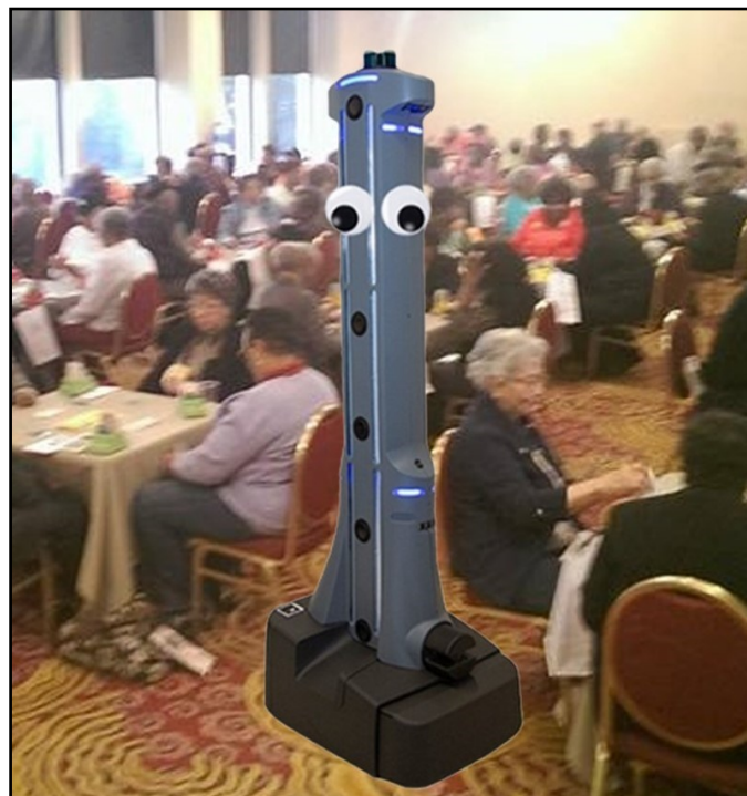
Respect Zero Tolerance Guidelines or iRobot may be your director

Shortly after that, unfortunately, Bertha died. A few nights later Sarah was awakened from a sound sleep by a blinding flash of white light, and a voice calling out to her, "Sarah, Sarah." "Who is it?" asked Sarah, sitting up suddenly, "Who is it?" "Sarah—it's me, Bertha." Sarah said, "You're not Bertha. Bertha just died." "I'm telling you Sarah. It's me. Bertha." insisted the voice. "Bertha! Where are you?" "In heaven," replied Bertha. "I have some really good news and a little bad news." "Tell me the good news first," said Sarah. "The good news," Bertha said with joy and enthusiasm, "is that there's Bridge in heaven. Better yet, all our old buddies who died before me are here, too. Even better than that, we're all young again, no aches or pains. Better still, it's always Springtime and it never rains or snows. And best of all, we can play Bridge all we want, day or night and we never get tired." "That's fantastic," said Sarah. "It's beyond my wildest dreams! So, what's the bad news?" Bertha said, "The bad news is that you're my partner for Tuesday's game."